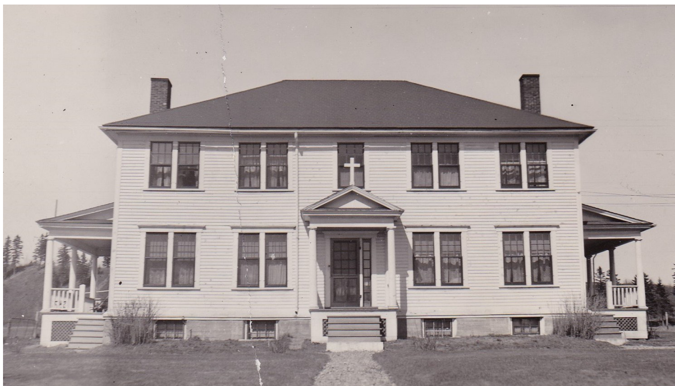
St. Ann's Teacherage and Hospital, Maliseet, Tobique, New Brunswick