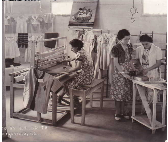
Tobique Indian Day School 1928, Maliseet