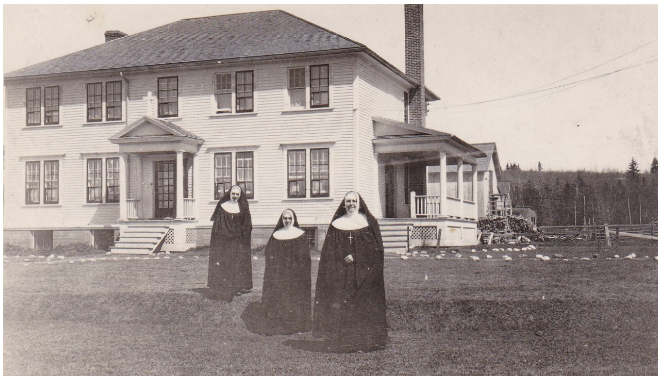
Three Franciscan Sisters (who were in charge of the mission prior to the arrival of the Sister of Charity of the Immaculate Conception) stand in front of St. Ann's Teacherage and Hospital, Maliseet, Tobique, New Brunswick