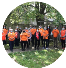
Ininew Patient Service Kingston, Ontario