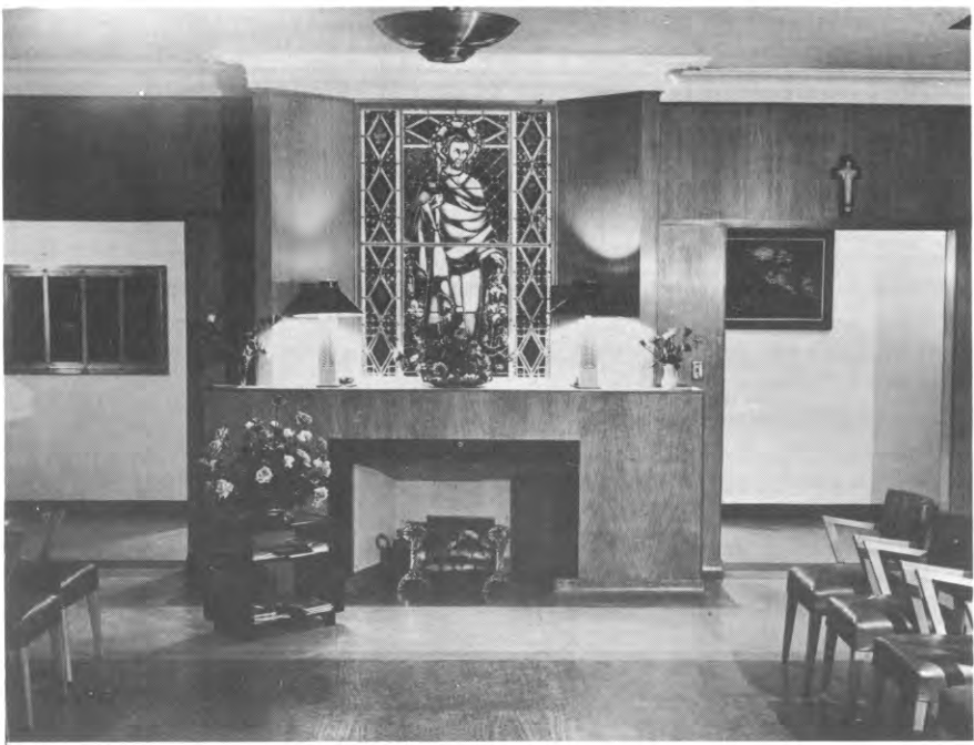
Saint Joseph's Hospital - Main Lobby