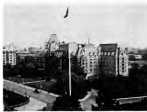
Beacon Hill Park, Victoria, B.C. Favorite resort of nurses