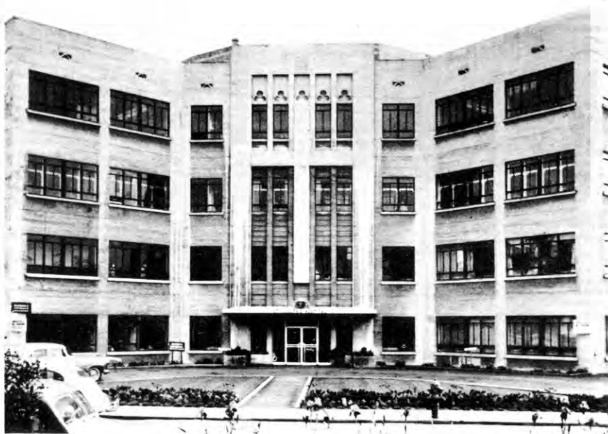
Saint Joseph's Hospital - from Collinson Street