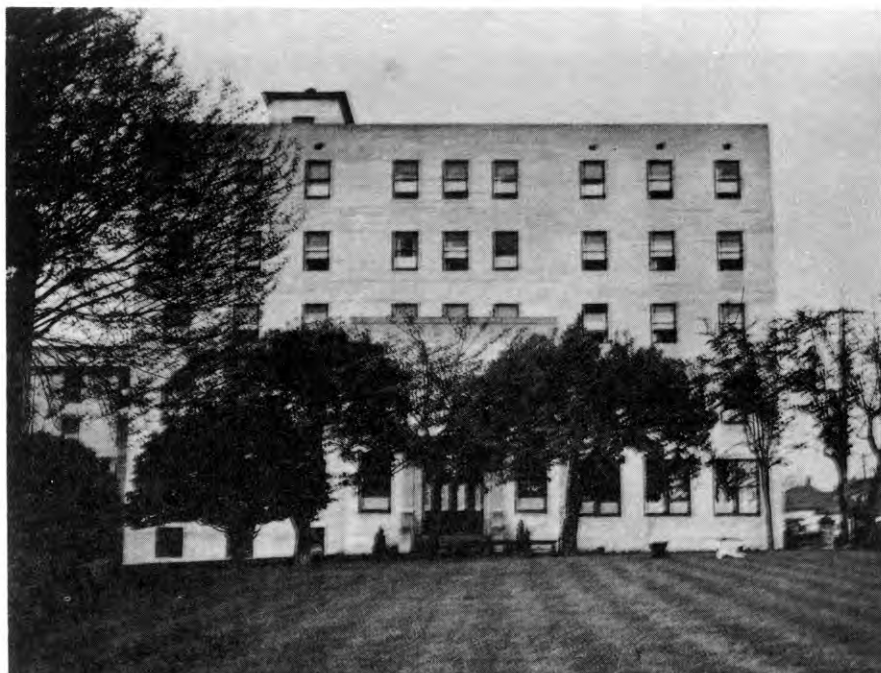
St. Joseph's Hospital School of Nursing Residence