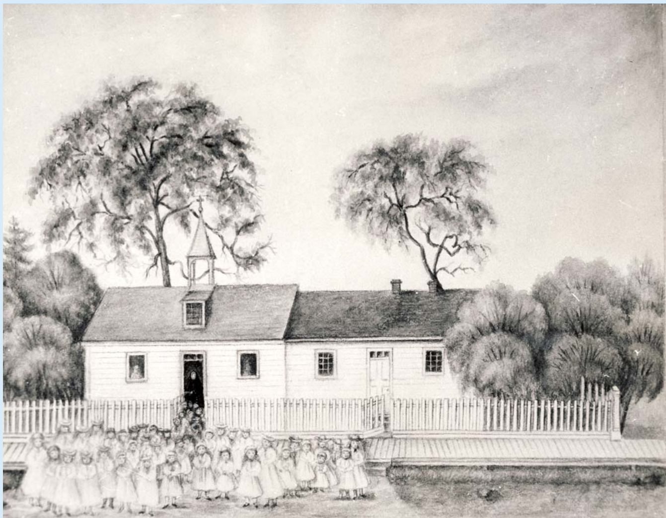
The log cabin from which Sisters of Saint Ann began their work of nursing