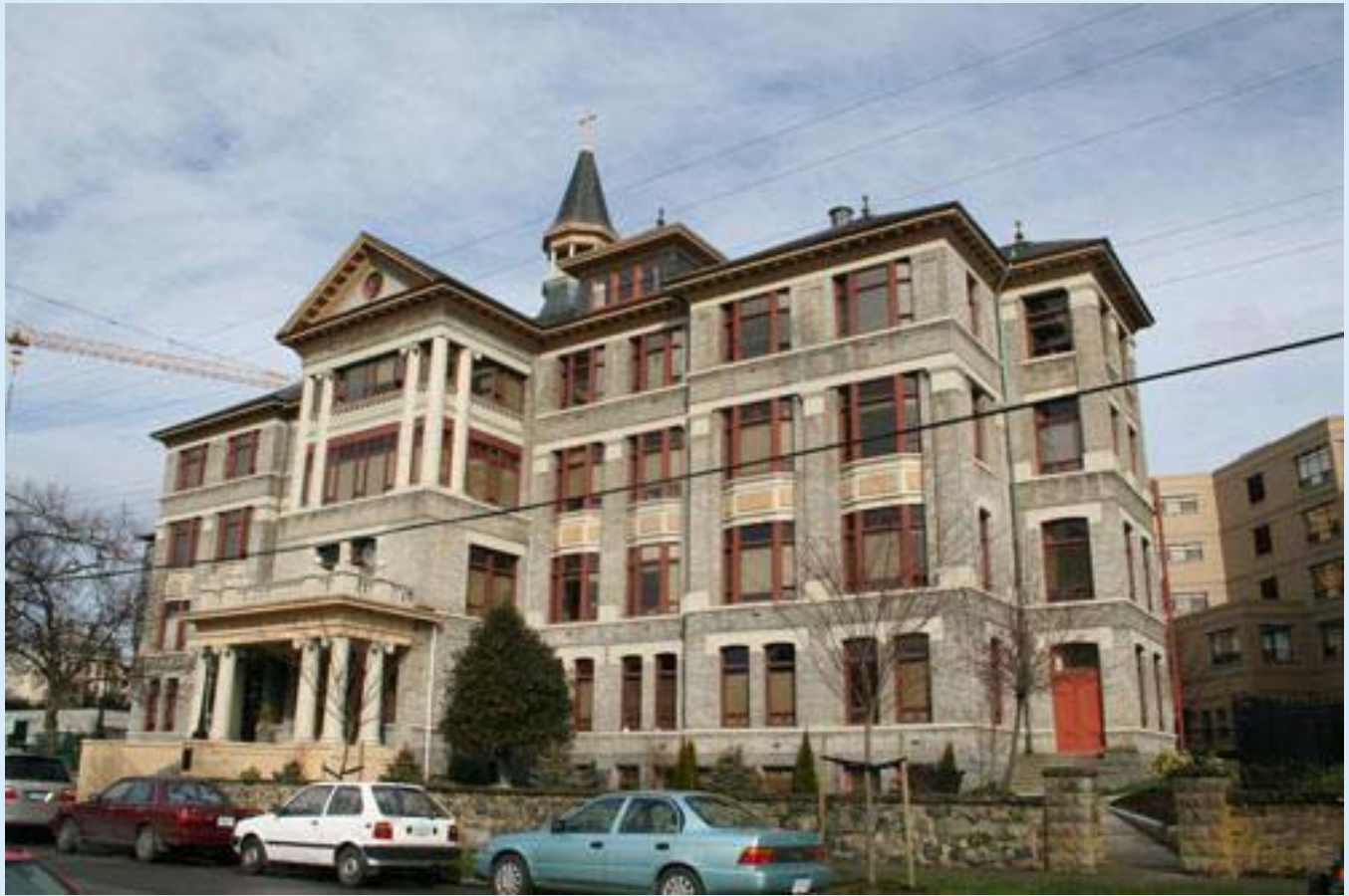
St. Joseph's Hospital, Victoria 1876-1962