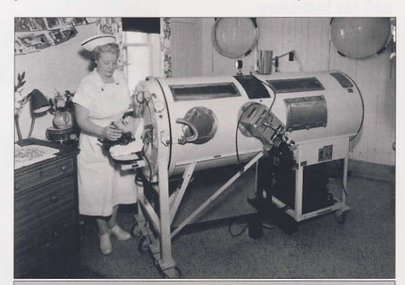
The iron lung was state-of-the-art equipment used to assist polio victims' breathing during recover.

1947 On January 1st the government of Premier (and Minister of Health) Tommy Douglas enacted the Saskatchewan Hospital Services Plan. The plan assured that, for a $5 annual fee (to a maximum of $30 for a family), all Saskatchewan residents had the right to receive all hospital services, with the exception of very expensive services and products such as transfusions and plasma.