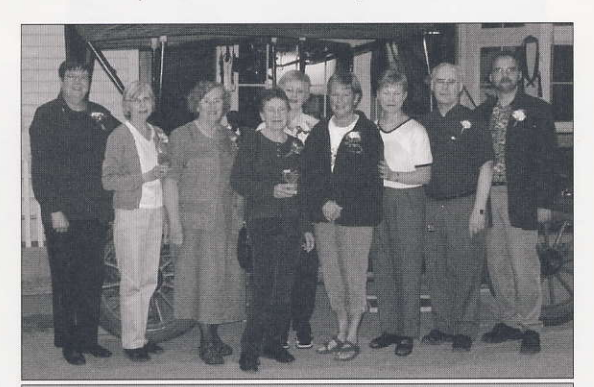
On-going professional development is important to the Spiritual Care department, shown here during a recent annual retreat.

Religious Care addresses the religious needs of patients. It is an expression of