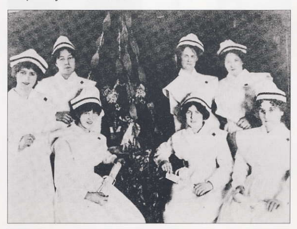
SPH Nursing School grads of 1915

On June 22nd an extension increased capacity to 45 beds.