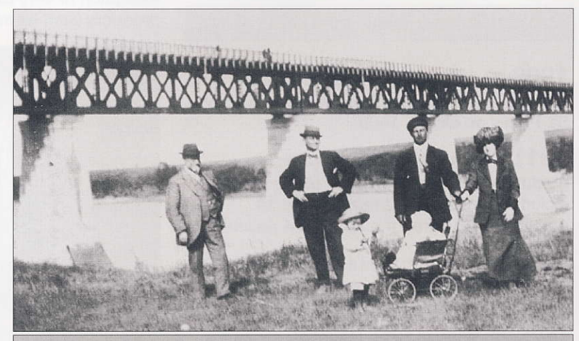
Saskatonians pose for a photo at the newly constructed CPR bridge.