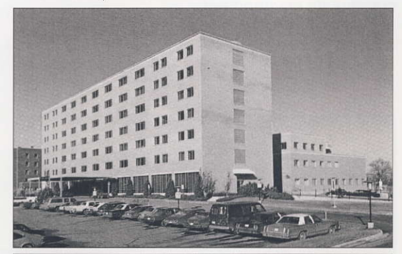
The 1963 new hospital Is now known as "B-Wing".

1963 The brand new St. Paul's Hospital was officially opened and blessed on September 21st. It was opened to the public in November and the old buildings were demolished. Physicians from SPH were an integral part of the first kidney transplant performed in Saskatchewan (only the second in Canada) in November.