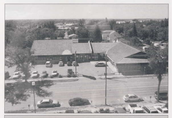
The Community Renal Health Centre

The opening of the Community Renal Health Centre in May will mark the completion of the Hope, Spirit, Excellence Campaign. The centre will be located across the street from St. Paul's Hospital and will offer additional hemodialysis services in a less clinical, more community environment.