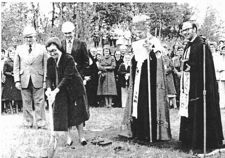
Sod Turning Ceremonies Sept. 13, 1978

May God bestow His abundant graces of health and happiness upon all those who have been associated with Mary Immaculate Hospital and those who continue to work for His glory. May He grant eternal rest and memory to those who have departed to Eternal Life.