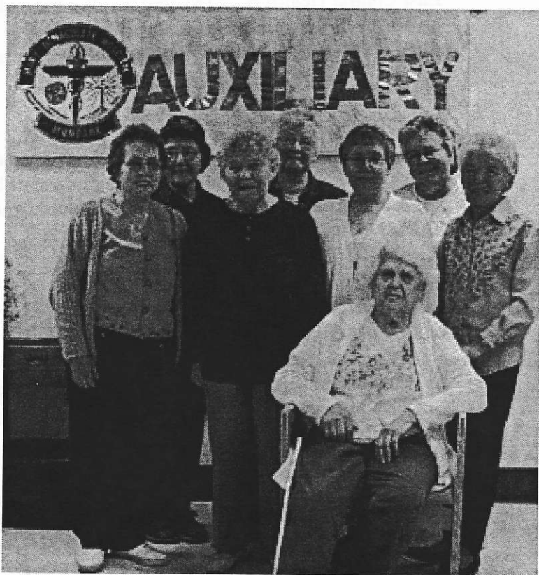
Mary Immaculate Hospital Auxiliary June 2004