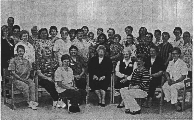
Mary Immaculate Hospital Staff June 2004