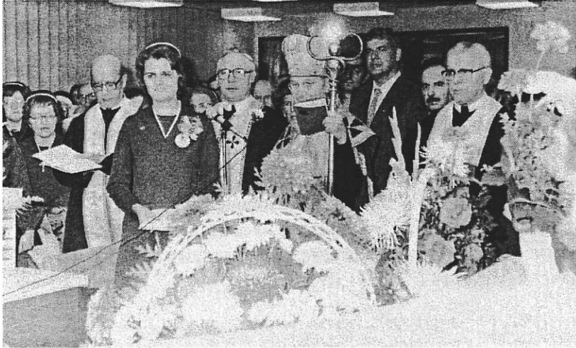
Official opening of Mary Immaculate Hospital Nov. 18, 1979