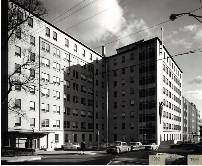
Figure 3. The Queen Street Halifax Infirmary. The prominent Jesus statue on the exterior wall may now be found at St. Vincent de Paul Parish in Cole Harbour. Photographer unknown. Taken sometime after 1961.

was an era marked by poor morale, with substantial concerns regarding equipment quality and maintaining high standards of patient care. 23