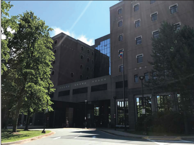
Figure 6. Summer Street entrance to the new Halifax Infirmary

in the drastic announcement of Code Orange, usually reserved for mass casualty events. 80 Intended to alleviate the strain on Emergency Department resources, this action compelled in-patient units to hasten admission of Emergency Department patients. This practice would later be redeveloped into a new Code Census alert. Though the June 2009 opening of an extensive Emergency Department expansion was hoped to provide some relief for this overcrowding, the capacity of the Halifax Infirmary is still continually being tested, with 23 Code Census alerts in January 2017 alone. 80-82