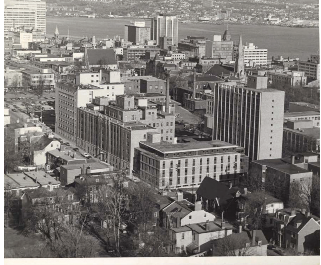
Figure 4. Aerial photograph of the Queen Street Halifax Infirmary. Gerard Hall still remains, as a Dalhousie University student residence. Mid-1970s.

With the opening of the Isaak Walton Killam Hospital for Children in 1971, the Halifax Infirmary shuttered its Pediatrics unit. A few years later, in 1976, Obstetrics would experience the same fate, leaving the Salvation Army-administered Grace Maternity Hospital to assume pre-eminence for maternal care in Halifax. 26 Fortunately, this decade did not exclusively see the diminution of services from the Infirmary, as Otolaryngology and Ophthalmology were moved in the Victoria General and Camp Hill Hospitals to be consolidated at the Halifax Infirmary in 1979. 27,28 Indeed during this decade, demographic changes and financial challenges contributed to numerous calls for further amalgamation of the Halifax hospitals, and elimination of redundancies. 29-31 In 1980, there were announcements