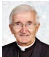
Archbishop Bertrand Blanchet Archbishop Emeritus, Rimouski