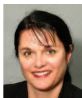
Hazel Markwell Centre for Clinical Ethics Toronto