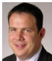
Eoin Connolly Centre for Clinical Ethics Toronto