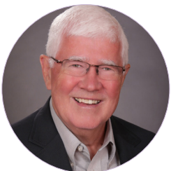
Glen Wood Catholic Health Sponsors of Ontario, Toronto, ON