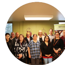
Seneca Warm Line