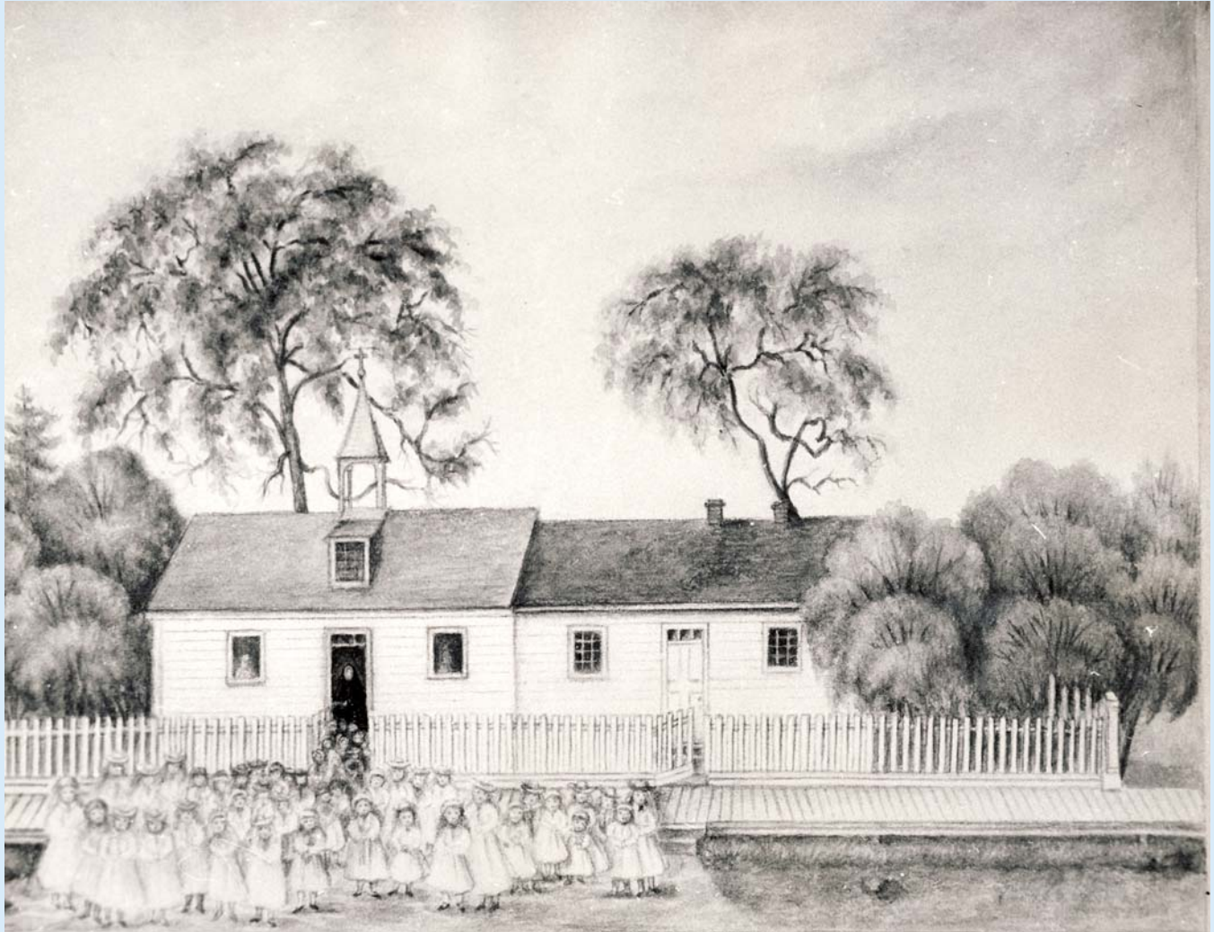
The log cabin from which Sisters of Saint Ann began their work of nursing