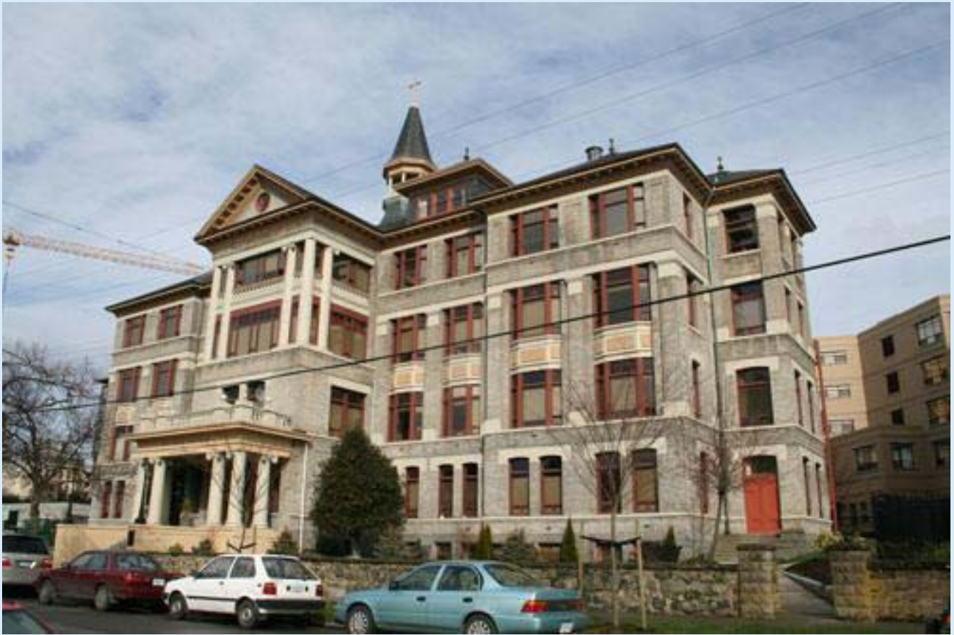
St. Joseph's Hospital, Victoria 1876-1962