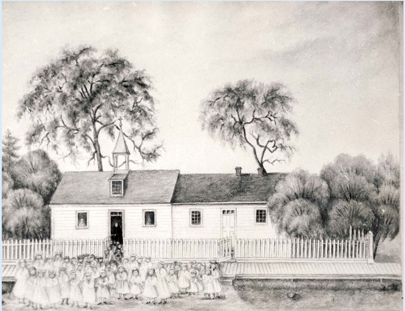
The log cabin from which Sisters of Saint Ann began their work of nursing