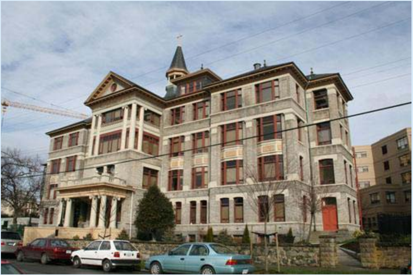
St. Joseph's Hospital, Victoria 1876-1962